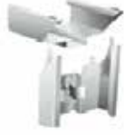
Knock-down (KD) assembly with tabs and compression anchor.